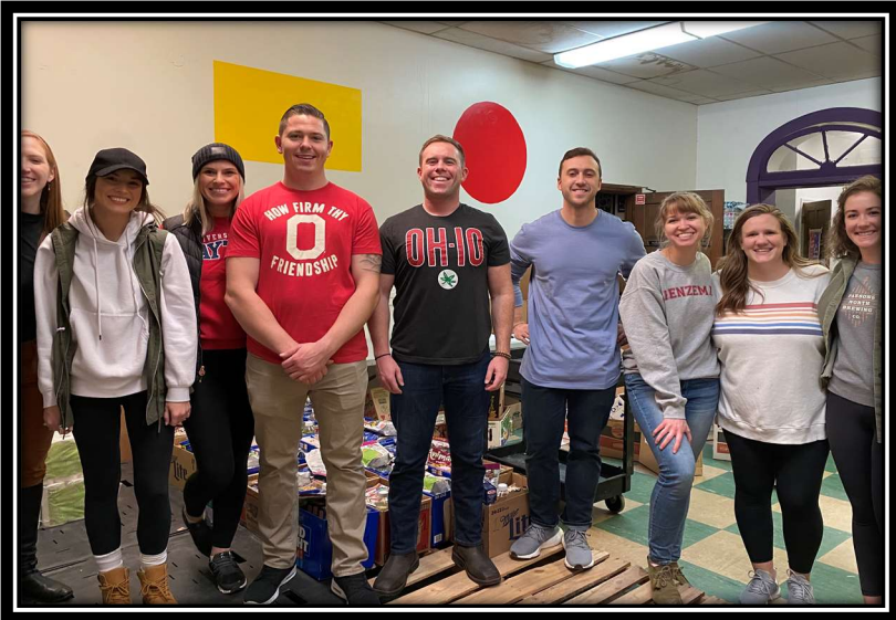
St. Mary's Young Adult Group