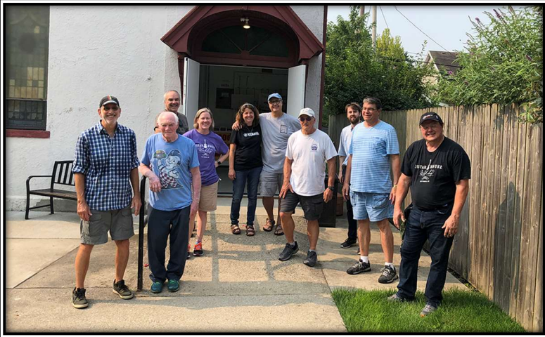
June Truck Unloading Crew

A Heartfelt Thank You TO ALL OF OUR AMAZING VOLUNTEERS! We couldn't do it without you!