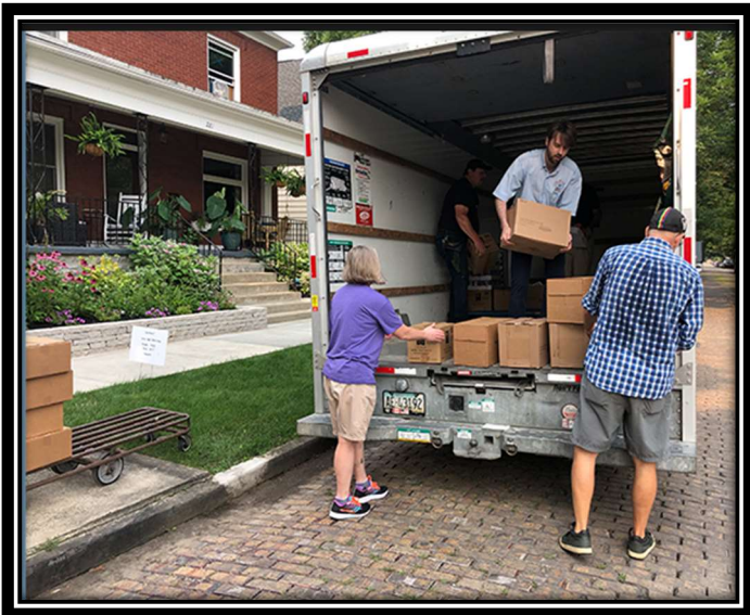
Crew Members unloading June food order

A Heartfelt Thank You TO ALL OF OUR AMAZING VOLUNTEERS! We couldn't do it without you!